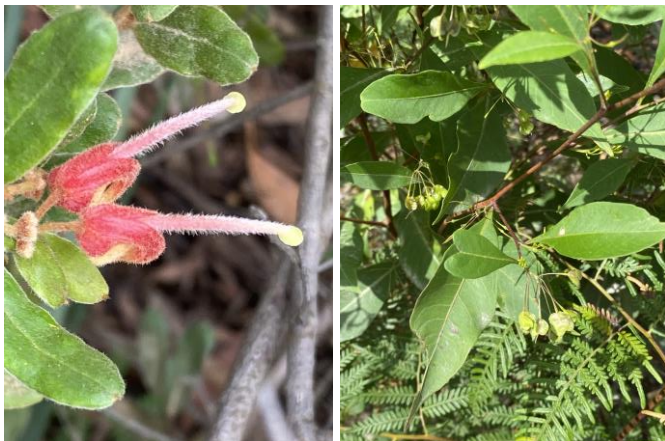
Nowa Nowa Grevillea (left) and Large-leaf Hop-bush