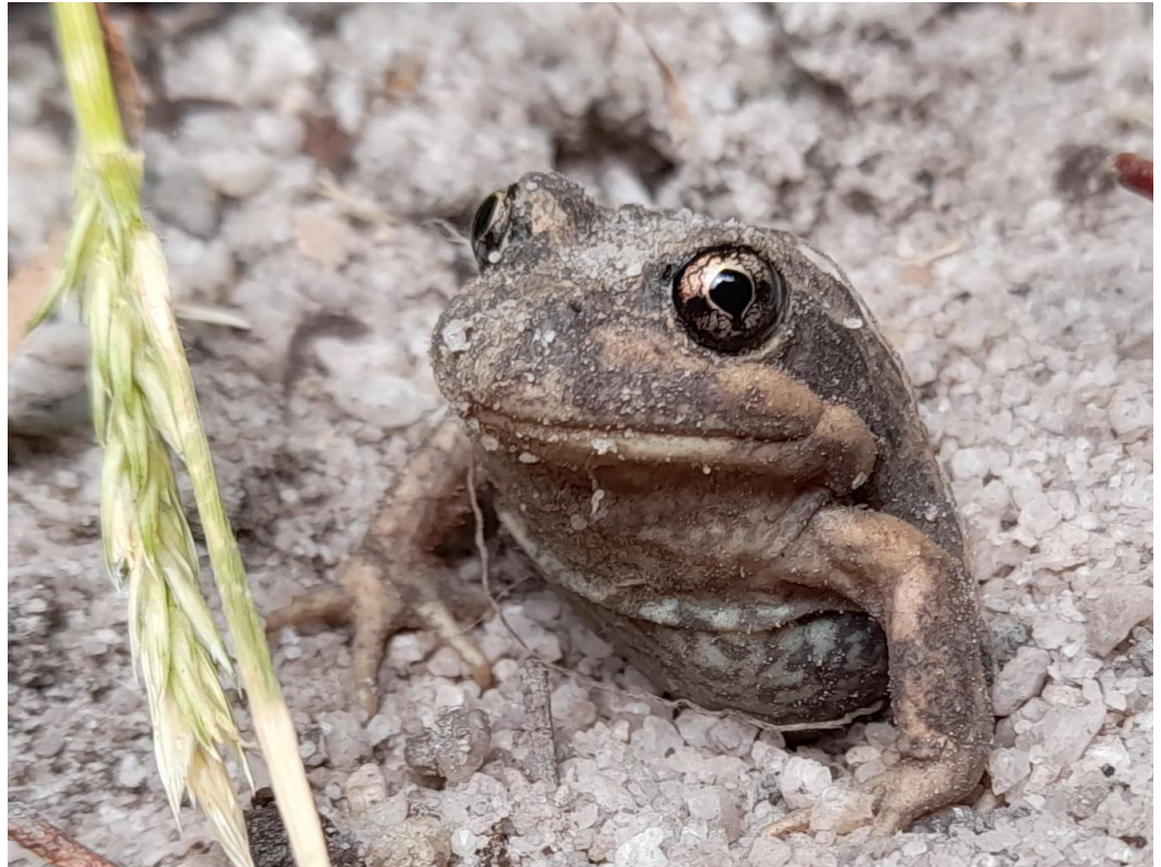
An Eastern Banjo Frog, or Pobblebonk, Limnodynastes dumerilii during the Club's excursion to Witts Gully in November 2020.

Held at 7:30 pm on the fourth Friday of each month at the Newborough Uniting Church, Old Sale Road Newborough VIC 3825