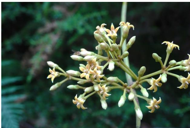
Twining Silkpod Parsonsia brownii