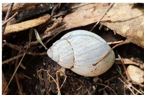
Shell of Pygmipanda kershawi

Our group then split off in three directions; I headed west with some others along the Gippsland Lakes Discovery Trail, which follows an old tramway line used for transporting granite from a nearby quarry to Lakes Entrance from the early 1900s to mid-1930s. Some of this granite was used to construct the current entrance to the Gippsland Lakes after the old timber one had been severely damaged by marine molluscs known as "shipworms" ( Teredo sp). Chunks of the beautiful pink and grey granite were present along the edge of the track.