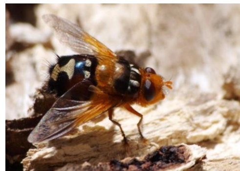
Microtropesa sinuata

Approximately 1 km from the picnic ground, we came to a wooden crossing over the creek, which marked the end of the Tramway Walk section. Most people returned to the carpark and headed elsewhere for lunch before our afternoon excursion, however I ventured up a mountain bike trail called Tin Shed Track. The track was narrow and winding as it made its way uphill into drier habitat. It was fairly quiet and becoming warm and humid by this stage, but I was delighted to find three flies adorned with interesting colours and patterns.