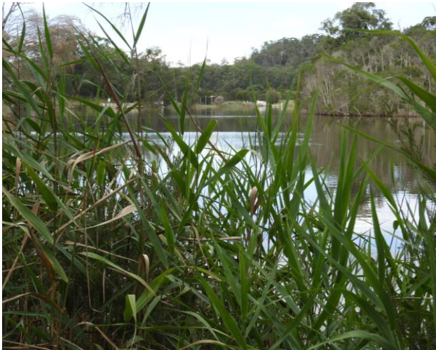
Nowa Nowa Wetlands Walk

In one of the best attended Club camps on record, 40 members and friends converged on the small township of Lake Tyers Beach on Friday 5 th February. Nearly everyone stayed in cabins or on campsites in the Lake Tyers Caravan Park, attractively located right on the foreshore.