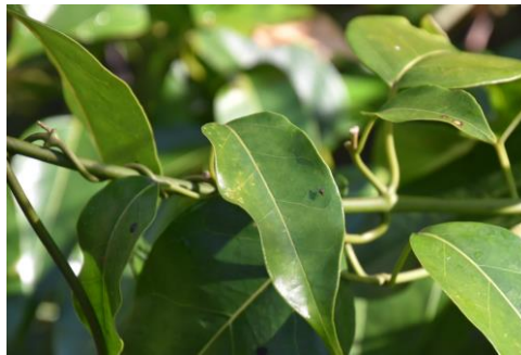
Milk-vine Marsdenia rostrata

A common component of warm-temperate rainforest and moist lowland forests from the Mitchell River Gorge area eastwards. Also Qld, NSW, Papua New Guinea, New Caledonia.