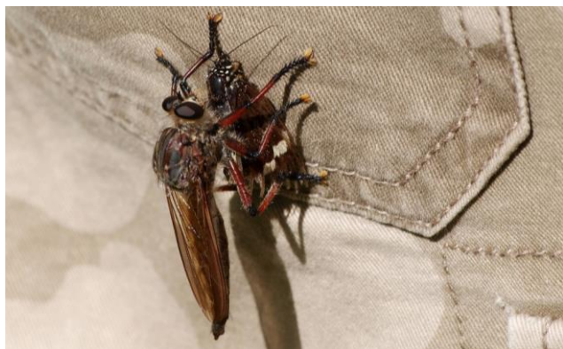
Neoaratus hercules with moth prey

On my way back towards the carpark, I bumped into Matt and we decided to walk a short way up the Limestone Box Forest Trail. The habitat was drier up here, mostly stringybark forest with a bracken understorey. Amidst the monotonous bracken, I noted an occasional Satin Everlasting or Narrow-leaf Geebung, and Matt found a nice metallic red and green bug.