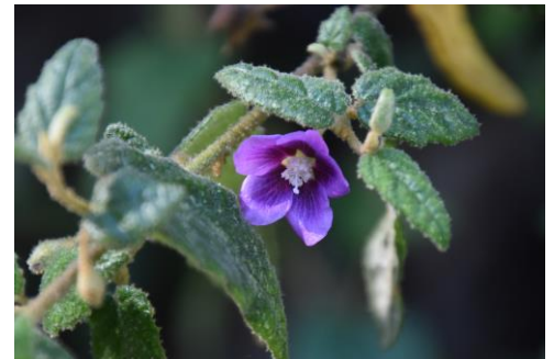
Blue Howittia Howittia trilocularis

Apart from an isolated occurrence at Tarra Valley in the Strzelecki Ranges, apparently confined in Victoria to rainforest gullies and wet sclerophyll forests east of the Gippsland Lakes.