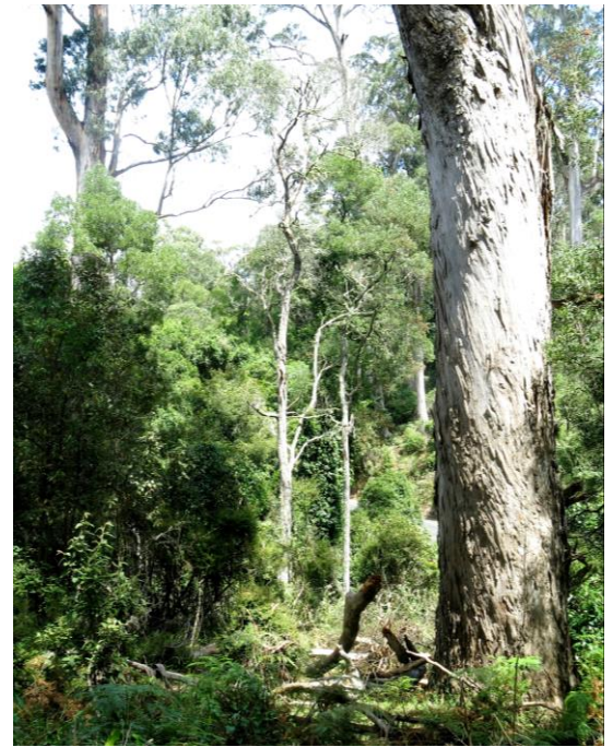
Rainforest canopy encroaching on eucalypt forest at Marsdenia Walk

See Appendix II for a photograph, taken from Bill Peel's rainforest restoration manual, showing natural succession from eucalypt forest to rainforest at Lakes Entrance.