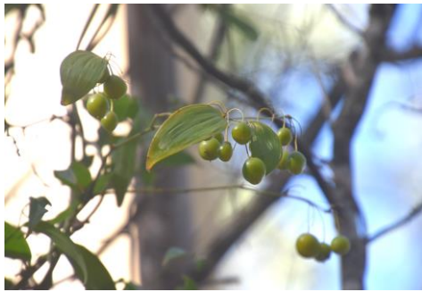
Wombat Berry Eustrephus latifolius

Our first stop was the Marsdenia Rainforest Loop track and our first look at some East Gippsland Warm Temperate Rainforest. These are some of the plants that we were seeing: