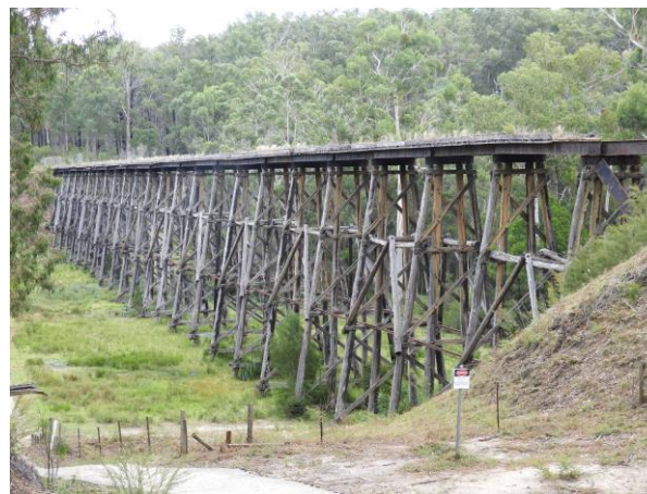
Stony Creek Trestle Bridge