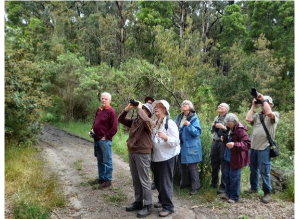
Birdwatchers botanising