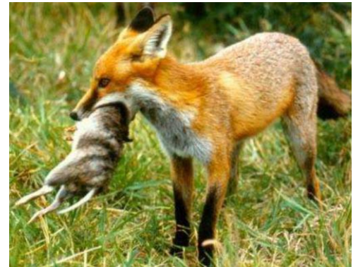
Fox with Eastern Barred Bandicoot

In 2006, an ambitious plan was hatched to not just control foxes on the island, but to eradicate them, which required a coordinated baiting effort on public and private land, and monitoring of fox numbers using spotlighting, camera traps and fox detection dogs. Based on control efforts and numbers of fox sightings, a Bayesian catch-effort model was developed to calculate the optimal time to declare that foxes had successfully been eradicated and to cease control efforts. Phillip Island declared itself fox-free in 2017, which was a major achievement given that the island is three times larger than any other island in the world from which introduced red foxes have been removed, and because the island is inhabited, which created additional socio-political challenges around fox control. The connection of the island to the mainland via a bridge was an additional consideration, however genetic analysis of fox scats is able to differentiate island foxes from mainland foxes, and has shown that migration to