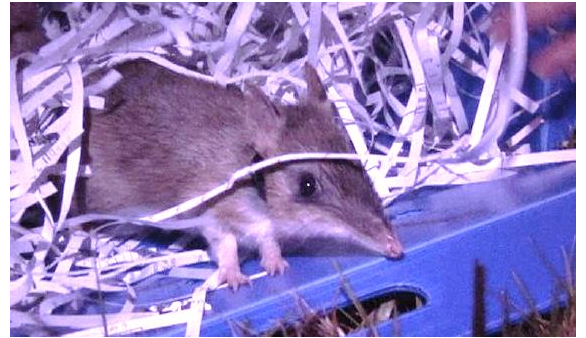
Nocturnal release of an Eastern Barred Bandicoot

Following the resounding success of the trial, the next step was to introduce 67 bandicoots on Summerlands Peninsula at the western end of Phillip Island, between October and December 2017. These were taken from Churchill Island, as well as Woodlands, Hamilton and the Zoos Victoria captive breeding program, to increase the genetic diversity of the population. The Peninsula has dense tussock grasslands and bushland, however it is not free of feral cats, so a key focus of this release was to determine whether the bandicoots could establish in the presence of the cats. As well as posing a predation risk, cats are a vector for toxoplasmosis, a disease to which bandicoots are highly susceptible. Radiotracking and cage-trapping of bandicoots was undertaken to assess their survival rates, abundance, breeding conditions and to take blood samples to screen for toxoplasmosis.