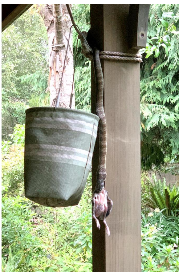
The snake with the second chick

should have done that before, but I was concerned that the parents would abandon the nest if we interfered with it. They didn't, and the next day I could watch them coming in and out feeding their last baby. It grew quickly once it got all the food and left the nest 6 days later. I didn't see it fledge and neither did I see it in the garden, although I thought I may have heard it begging for food a couple of times. They make an annoying, monotonous 'peep peep' which would drive me mad if I was their parent. To my surprise and pleasure, a month later we had a good view of it when we were having our afternoon cuppa on the front verandah. A parent was foraging quite close to us, and the well-grown baby with its speckled front popped out from a garden bed to be fed.