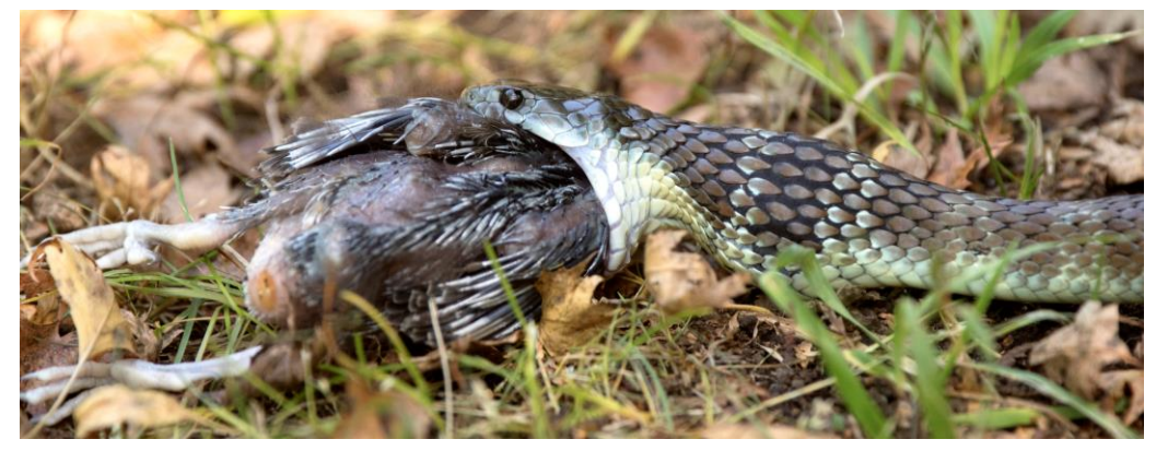
Tiger snake attempting to swallow Shrike-thrush chick

We threw the dead bird down so the snake could have it and hopefully leave the others alone. Soon the snake reappeared and slithered around in the garden bed, but didn't come and find the bird, so Ken threw it across to where the snake was. Instantly it seized the bird and proceeded to try and swallow it. This was a long process as it could get the head in easily enough but the body was about twice the diameter of the snake's body, and a quick Google search told me that a snake can really only swallow something about the same diameter as it is. I had seen this tiger snake a number of times in our garden this summer and it was a medium size, about 70 cm long.