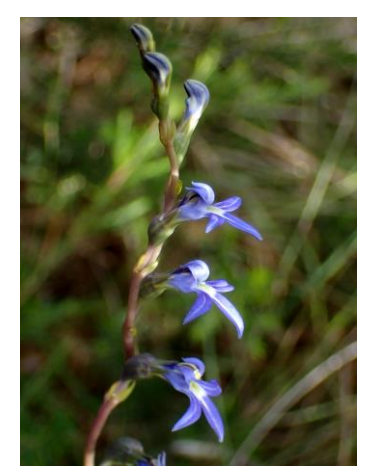
Tall Lobelia