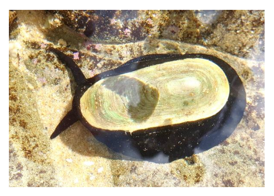
Elephant Snail

As we walked further out where the rockpools were deeper, turning over some of the large rocks revealed different creatures. We saw quite a lot of chitons, mostly the Southern Chiton Ischnochiton australis which is apparently common. It has an unusual escape mechanism – if the rock it is on is removed from water, it curls up and drops back into the water. The other chiton we saw was the Elongated Chiton Ischnochiton elongatus . We were lucky to find a couple of Elephant Snails Scutus antipodes too. These large, black-bodied snails only have a small iridescent white oval