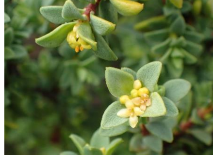
Thyme Rice-flower

Some plants were at the stage of seed dispersal. Berries added colour to the vegetation and were the subject of discussion – and some limited experimentation – about whether or not they were edible: deep red berries of Seaberry Saltbush, purple berries of Boobialla, shining blue berries of Black-anther Flax-lily and the small white balls on Coast Beard-heath. The abundant twisted pods of Coast Wattle, and the rich browns and distinctive shapes of sedges and rushes such as Zig-zag Bog-rush, Sea Rush and Gahnia trifida added character to