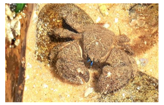
Hairy Stone-crab

plate for a shell on their backs creating a striking contrast to the body. A long pink worm we saw was a tube worm which would have had its fragile tube broken when the rock was turned over.