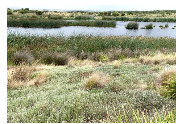
A carpet of Milky Beauty-heads

The Wonthaggi desalination site comprises 225 hectares of rehabilitated farmland, one of the largest ecological restoration projects in Victoria's history, with wetlands and dunes created to block the sight lines of the building and the land revegetated with 3.5 million new plants, including 150,000 trees. Some of this has been successful, other parts less so, with weed incursion seemingly not well-managed.