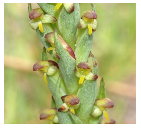
Disa bracteata

The bird hide was a side trip from the path but not a fruitful one as the wetland it overlooked had also become overgrown with vegetation. The path was lined with thistles and other weeds and was not inviting, although White-fronted Chats were seen in the low vegetation.