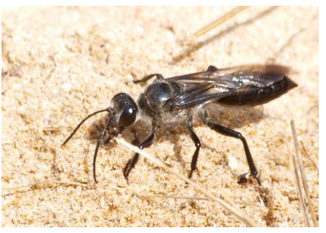
Digger Wasp

and it was easy to see the differences. A Black Digger Wasp Sphex cognatus , which lives and nests in large colonies 25-35 cm underground and comes out to feed on nectar and catch insects, was busy digging a burrow to deposit its catch for its young to feed on when they hatch. The female digs the burrow and closes the entrance over when she leaves.