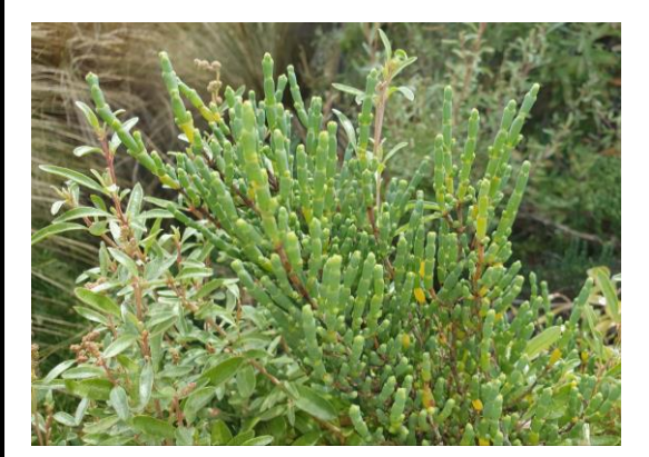
Marsh Saltbush (left) and Shrubby Glasswort

The walk started in typical coastal dune vegetation: Coast Tea-tree Leptospermum laevigatum, Coast Beard-heath Leucopogon parviflorus , White Elderberry Sambucus gaudichaudiana that had finished flowering, Bower Spinach Tetragonia implexicoma , Seaberry Saltbush Rhagodia candolleana and Native Raspberry Rubus parviflorus . Young Clancy and Mergie were very keen to try the ripe, edible fruits of these bush tucker plants, with mixed success!