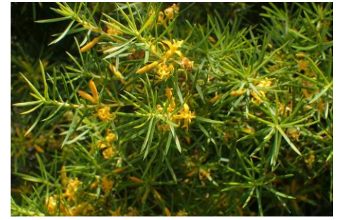
Prickly Geebung