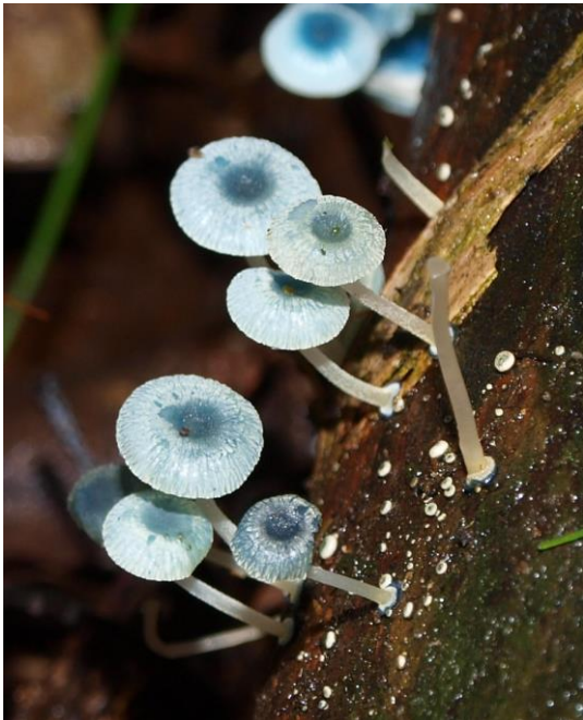
Pixies' Parasols

The forest appeared empty of birds until a flock of Yellow-tailed Black-cockatoos flew overhead. We reached Lizzys Leap, a small clearing, where we saw a Scarlet Robin on a fence post near a large Blackwood tree. Next we were alerted to Gang-gangs calling and seven were seen in the treetops.