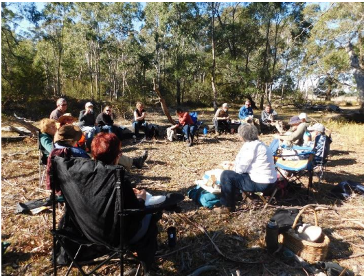
Lunch at Swallow Lagoon

Swallow Lagoon Nature Conservation Reserve is a short drive north of Stratford. It was established in April 2002 and covers an area of 194.7 hectares. It contains a variety of vegetation types including Plains Grassy Woodland, Lowland Forest, Damp Sands Herb-rich Woodland and derived native grassland. Grassy Woodlands are considered to be endangered in the Gippsland Plains bioregion and patches of this size and type are of high priority for conservation.