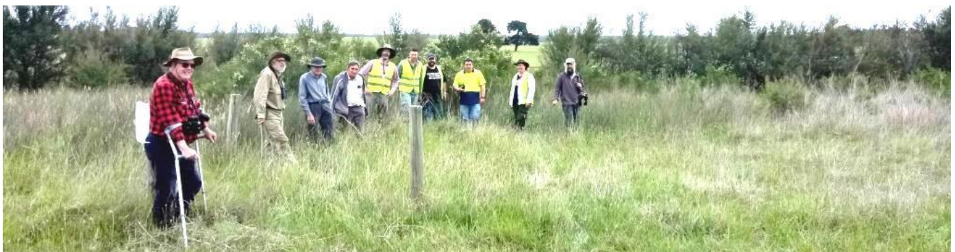
Preparing for the Longford Road orchid count