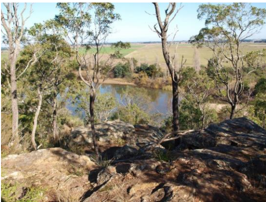
Avon River at The Knob Reserve.