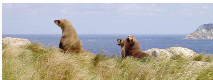
Australian Fur Seals

The Australian Fur Seal genus Arctocephalus migrated from Africa to Australia 18,000 – 12,000 years ago. Elephant Seals previously occurred in Bass Strait, but have disappeared over the years, and Australian Sea Lions could be put on the endangered list as the population of 14,000 is decreasing.