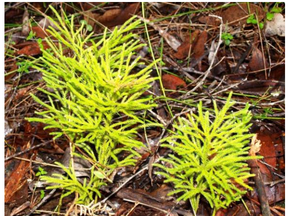
Club moss