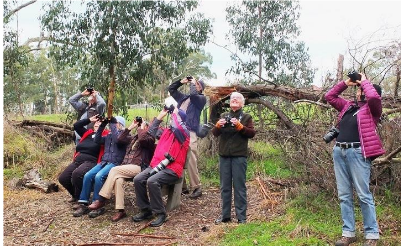
Keen birdwatchers at Thornells Reserve

Kind regards to all, and thanks to members of LV Field Nats, some who travelled a fair distance to experience the birds of Drouin.