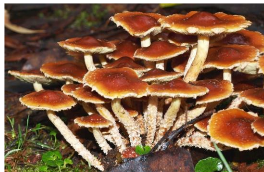
Hypholoma australe

Ken Harris, our leader for the day, took us on a circular route beginning at the River Walk near the picnic area. We passed through wonderful stands of Messmate, Narrow-leaved Peppermint, and Mountain Grey Gum. A large variety of fungi of every shape, size and colour kept the photographers busy – particularly a clump of over 50 pale tan ones close to the river, and white jelly and yellow coral fungi along the way.