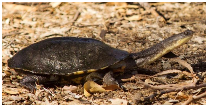
Eastern Long-necked Turtle

The Cheluidae can be further broken down into those with a neck longer than their carapace (the long-necked turtles, all from the Chelodina genus) and the rest, comprising several genera, all of which have a neck much shorter than their carapace. Short-necked turtles tend to be very opportunistic feeders, eating everything from fruit and algae to invertebrates, small vertebrates and carrion. Long-necked turtles are ambush predators and are strictly carnivorous, taking prey such as small fish, yabbies and tadpoles.