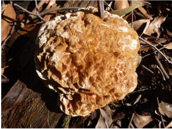
A possible Thelophora species

Several Trametes versicolor , with varying coloured rings, were growing in ranks on a log. Close by grew several small clumps of the bright yellow coral fungi Clavaria amoena and, further up the hill, clumps of a greyish Clavaria species. With deep-orange convex caps and stems, several fungi of a Laccaria species had grown through the hard surface of the track while the bulbous base and shiny yellow cap of Dermocybe canaria had recently pushed up through the soil. As its name suggests, Crepidotus eucalyptorum grows on eucalypts; it is a very small fungus with a short stem and curled-under rims on the caps.