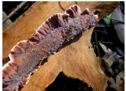
Shelf fungus Stereum illudens

Across the other side of the road, the track sloped down to a creek and up the far hillside where it was drier. The underside of a dead branch had been colonised by patches of the pinkish-violet, leathery shelf-fungi Stereum illudens , fringed with white, droplets of moisture adhered to it. Gathered together in the grass, the dainty Mycena albidofusca had flattened white tops to their pale brown and white conical, striated caps. Tiny Mycena viscidocruenta were only visible because of their bright scarlet caps and stems. Another Russula was thought to be Russula mariae . Growing amongst the litter were