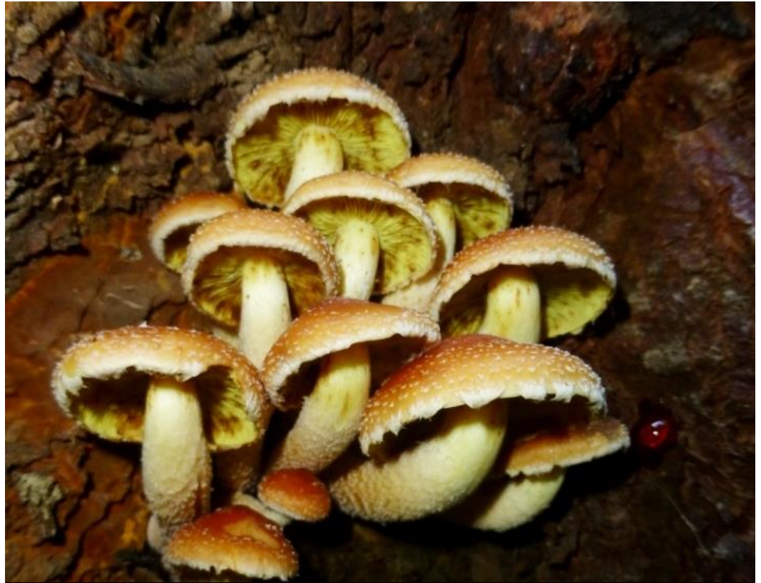
This attractive specimen of Hypholoma fasciculare was photographed at the East Tyers River campsite during a fungi foray in May 2015.

Held at 7:30 pm on the fourth Friday of each month at the Newborough Uniting Church, Old Sale Road Newborough VIC 3825