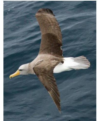
Chatham Island Albatross