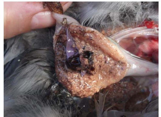
A balloon lodged in the stomach of one bird